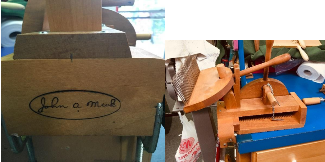
Russian Paddle Combs $270