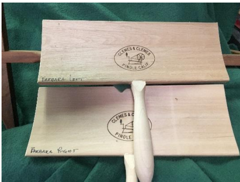
Hand Carders $117.