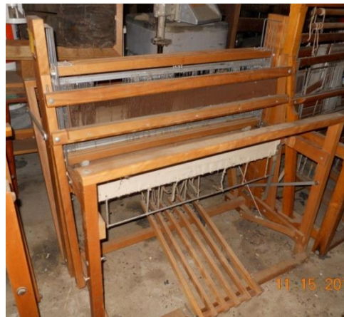
Counterbalance loom 40" weaving area

This is a counterbalance loom that is collapsible to save space ~