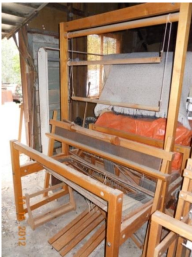
Nilus Leclerc loom 38" weaving area

Nikki Crain is helping Jeanette Barton find new homes for her looms. The looms have been in dry storage in a barn and have accumulated some dust, but otherwise are good, solid looms. If you are interested, call Nikki to get details – 561 4048 and make an offer.