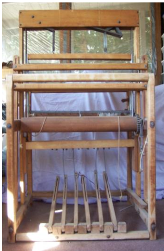
34” loom. Weaving width is 24”. Spring loaded treadles!! Is most likely red oak. $300 obo. Karen Dennis 561-4705