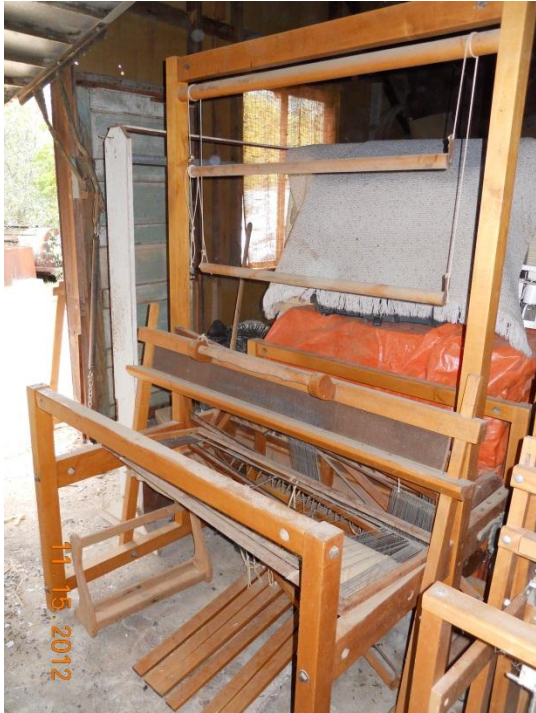
Counterbalance loom 40" weaving area $300 obo Has been in storage so is dusty. Nikki Crain 561-4048 *****