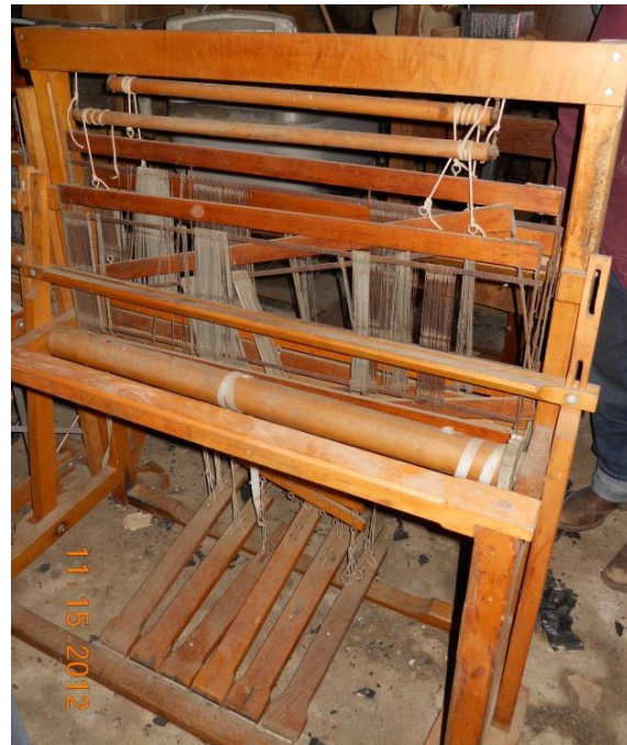
This is a counterbalance loom that is collapsible to save space ≈