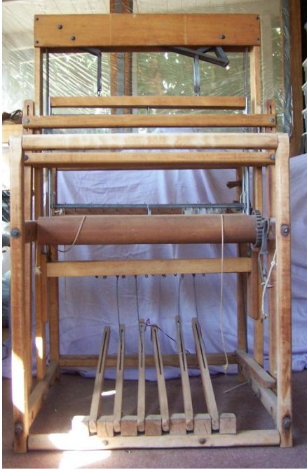
34" wide with 24" weaving area, spring loaded treadles! Most likely red oak. Metal heddles included. Quite sturdy. $300 obo Karen Dennis 561-4705