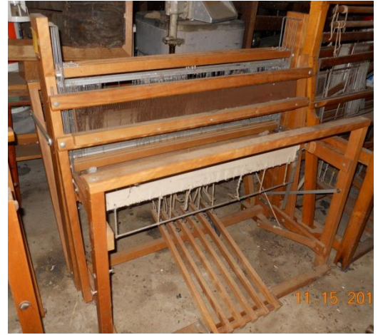
Nilus Leclerc loom 38" weaving area $850 obo. Has been in storage so is dusty Nikki 561-4048 *****