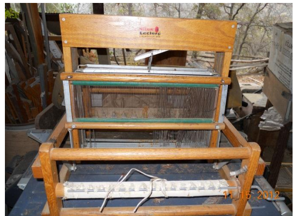
Nilus Leclerc table loom, approx. 20" weaving area. $300 obo Nikki 561-4048